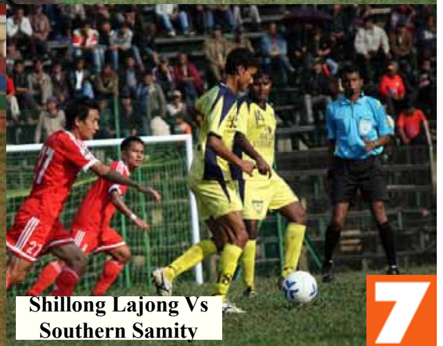
Shillong Lajong Vs Southern Samity