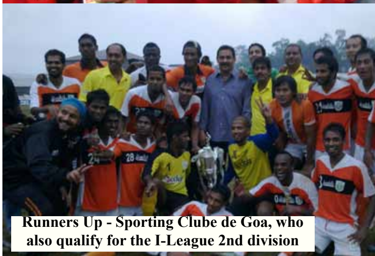
Runners Up - Sporting Clube de Goa, who also qualify for the I-League 2nd division