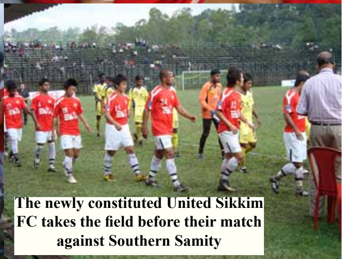
The newly constituted United Sikkim FC takes the field before their match against Southern Samity