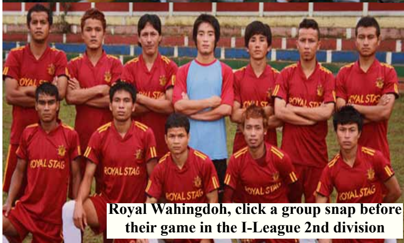
Royal Wahingdoh, click a group snap before their game in the I-League 2nd division