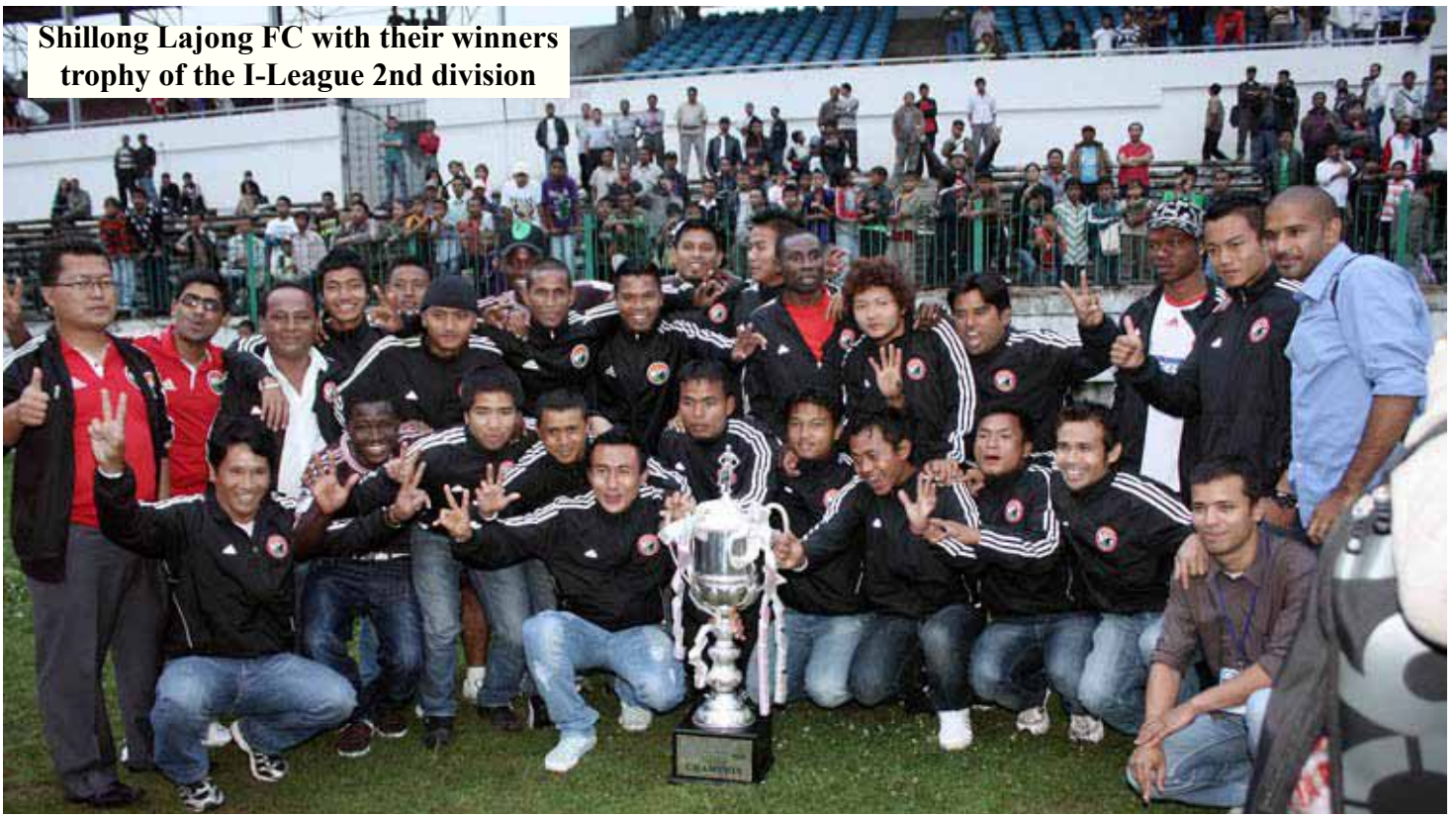
Shillong Lajong FC with their winners trophy of the I-League 2nd division