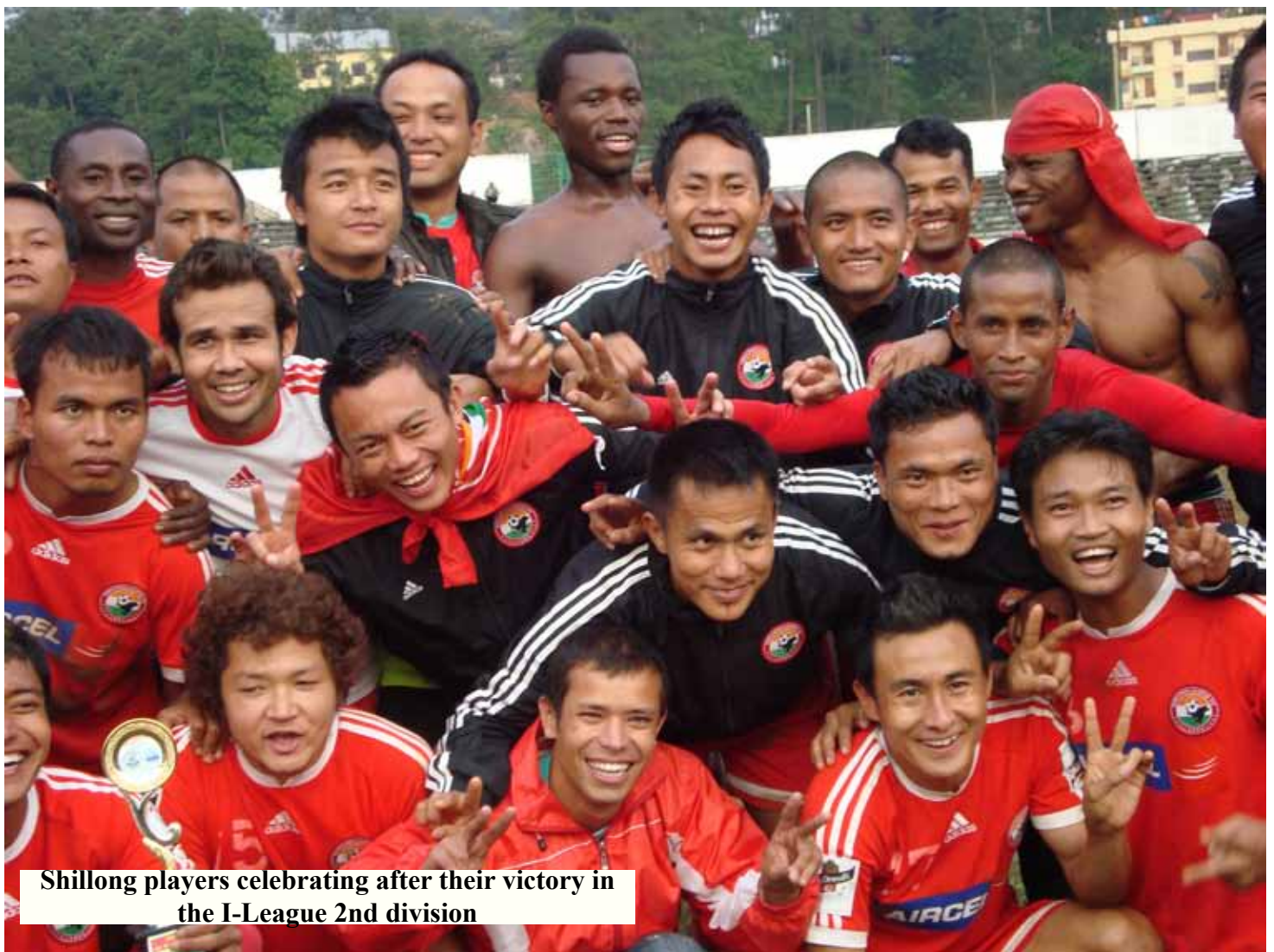
Shillong players celebrating after their victory in the I-League 2nd division